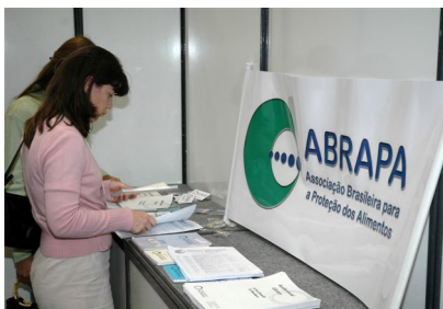
Promotional materials at the Brazil Association for Food Protection (BAFP) conference, June 2006.

Spring was quite a season for the Florida Association for Food Protection (FAFP) . An April educational luncheon at Publix Aprons Cooking School in Jacksonville focused on how growers and shippers can maintain the integrity of organic produce. In June, a second luncheon was held in Orlando to address lessons learned from the 2006 outbreak from E. coli O157:H7 in fresh produce, as well as disaster preparedness and recovery for retail and distribution. The FAFP Connection newsletter was produced for all members.